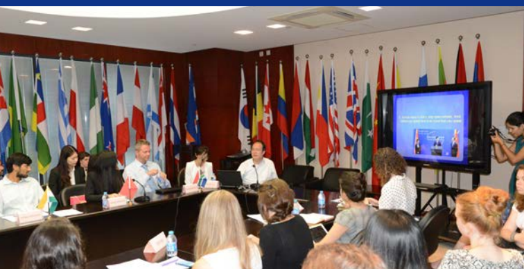
SIMULATION FOR PRESS CONFERENCE