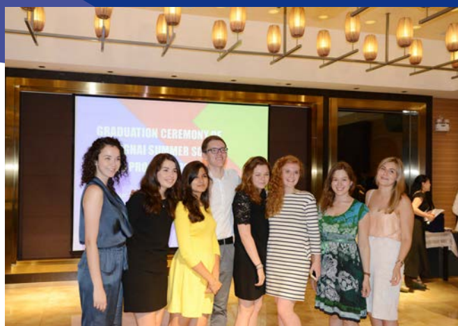
PARTY AT CLOSING CEREMONY