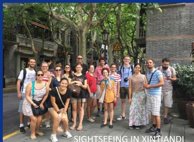
SIGHTSEEING IN XINTIANDI